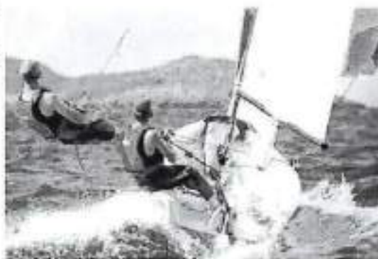
Totally random, coincidental and a propos nothing shot of a Laser 3000 to fill space.

WILSONIAN SAILING CLUB Hoo, Kent 01634 250318 www.wilsoniansc.org.uk